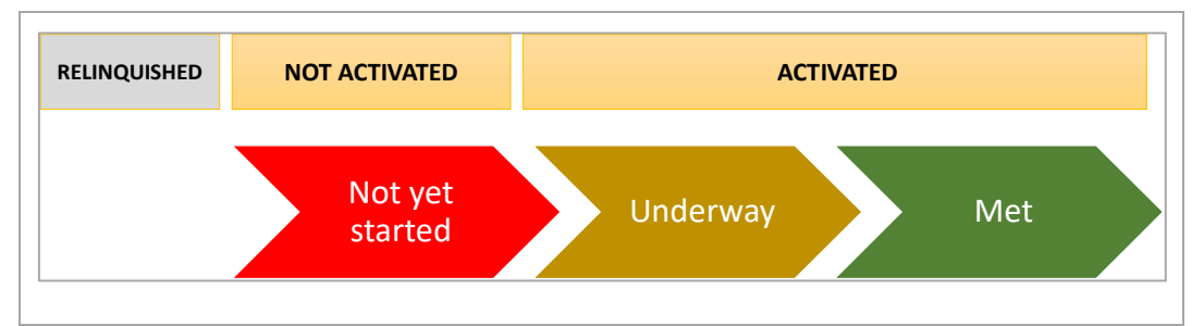
Figure 3. Status of commitments

Not activated, underway and met are mutually exclusive categories; a commitment cannot have more than one status at the same time.